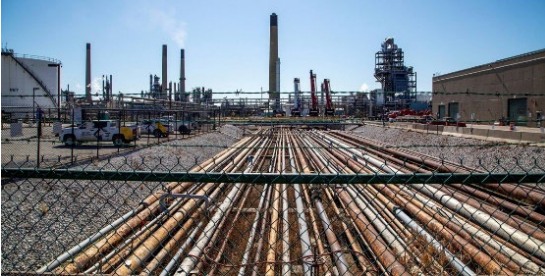
Colonial Pipeline Ransomware Attack cost them $4.2 Million to Undo