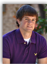
Warren Ethridge Biomedical Science Early