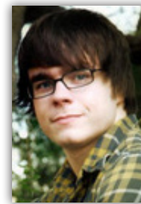
Christopher Willis Theatre Stephenville