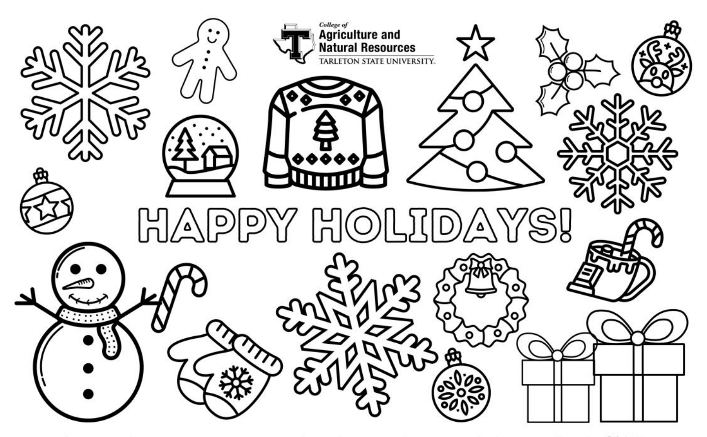
Snap a picture of your finished product and tag us on Facebook or Instagram @TarletonCOANR