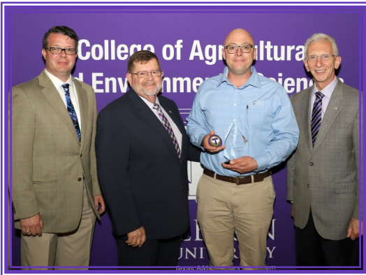
Clay Ewell Service Award