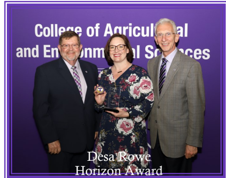
Desa Rowe Horizon Award