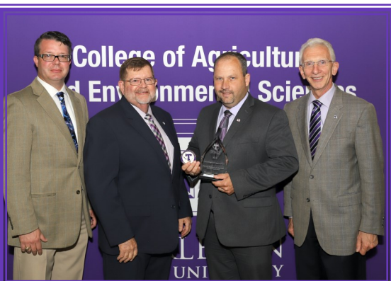
Agricultural Education Alumni Association Outstanding Philanthropist Award