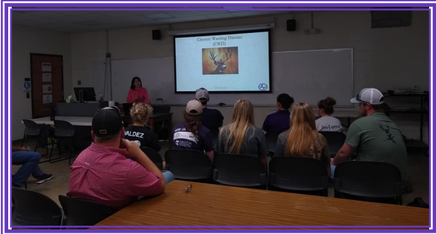
Tarleton WSES students learn about Chronic Wasting Disease and how to perform necropsies.