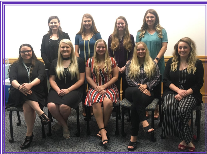
2018-2019 and 2019-2020 Members