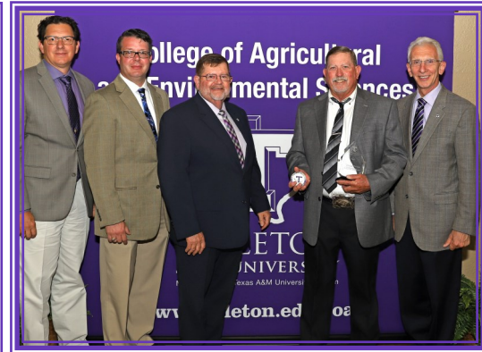
Calvin Hudson Service Award