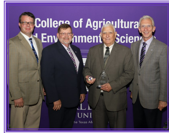
Gary Moore Dean's Award