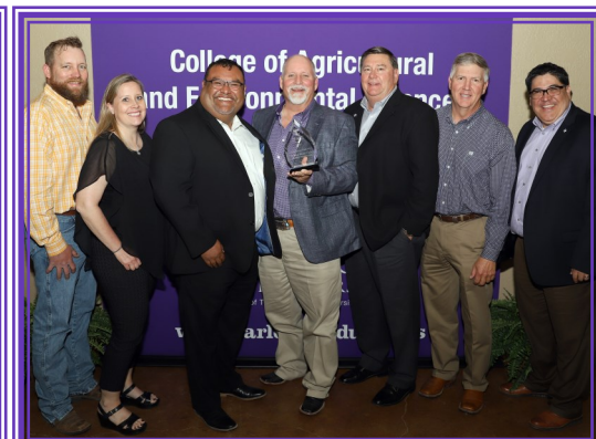
Meats Team Alumni Association Outstanding Philanthropist Award