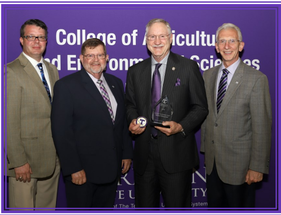
Mike Moncrief Lifetime Achievement Award

On April 27th, the College of Agricultural & Environmental Sciences hosted its annual recognition event to celebrate outstanding alumni, friends, faculty, staff & students of the college.