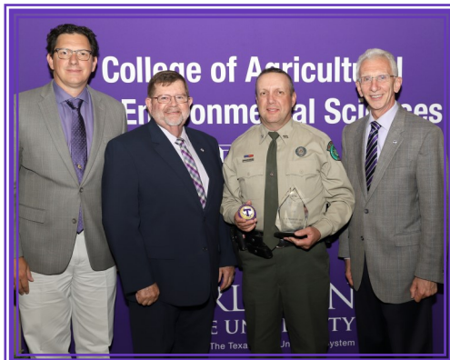
Donald Beard Trailblazer Award