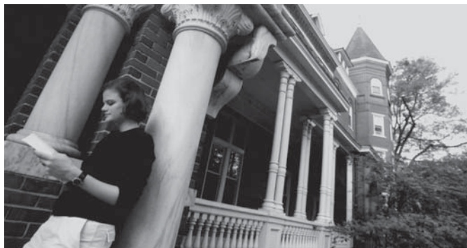
Agnes Scott College

Weights are applied to all comparison reports to adjust respondents within schools by sex and enrollment status and between schools to reflect the institutions' relative population sizes. Weights are calculated separately for first-year students and seniors. For detailed information about weighting, please visit the NSSE Web site at www.nsse.iub.edu/2007_Institutional_Report.cfm .