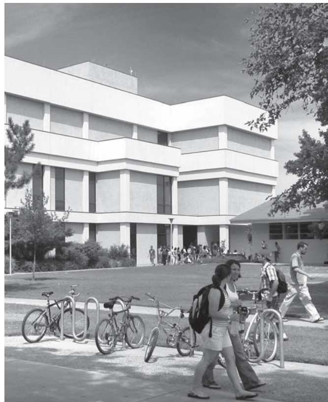
California State University, Fresno