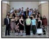
Trip to the Symphony