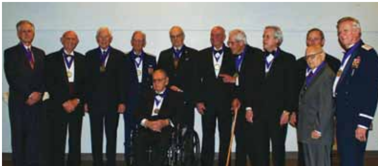
Distinguished Alumni Chapter