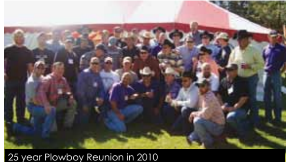
25 year Plowboy Reunion in 2010