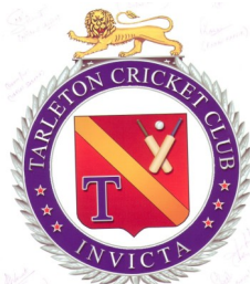
TSU Cricket Returns!