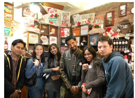
Tarleton International Students at the Dublin Dr. Pepper Museum in Dublin, TX